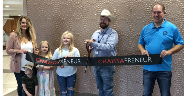
3C Hat Co. DURANT | DISTRICT 9