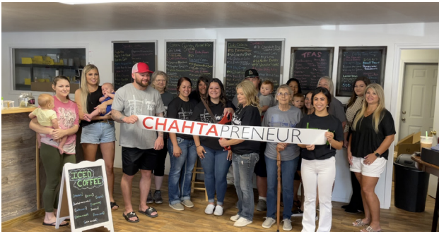
Green Country Nutrition HEAVENER | DISTRICT 4