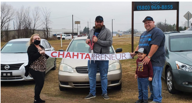
Oakes Auto Sales, LLC HUGO | DISTRICT 8