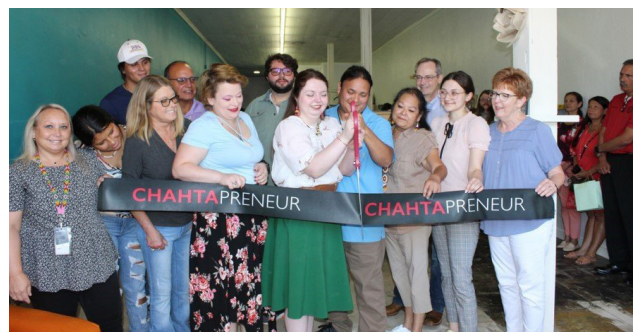
Sundrop Books DURANT | DISTRICT 9