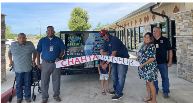
Allen's Pressure Washing, LLC SOPER | DISTRICT 8