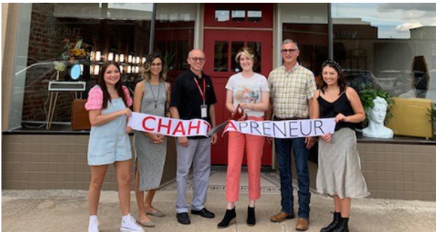
The Parlor MCALESTER | DISTRICT 11