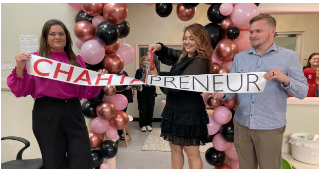
Brittany's Beauty Bar, LLC POTEAU | DISTRICT 4