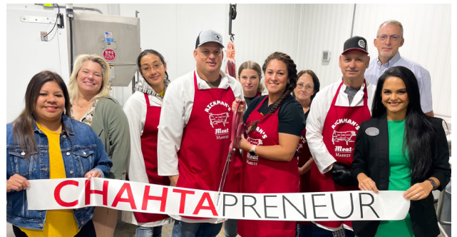
Rickman's Custom Meat Processing, LLC HUGO | DISTRICT 8