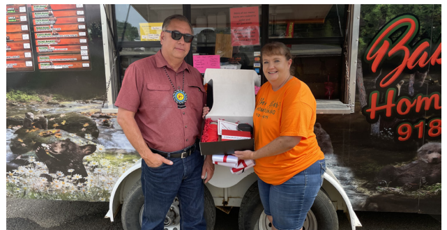
Baby Bear's Home Cooking WISTER | DISTRICT 4