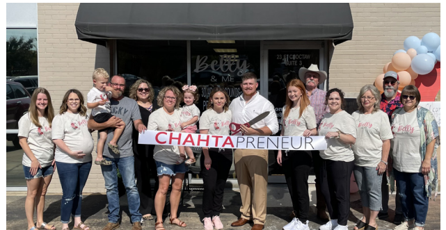
Belly & Me MCALESTER | DISTRICT 11