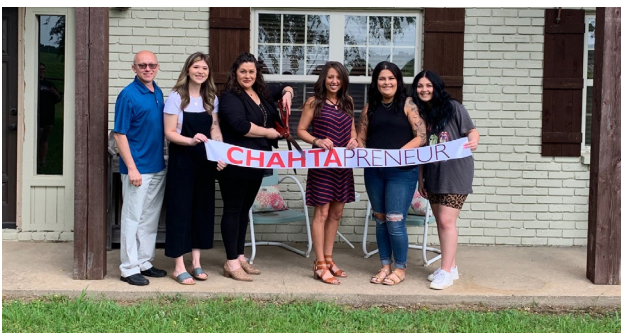
Tease Me Hair Salon MCALESTER | DISTRICT 11