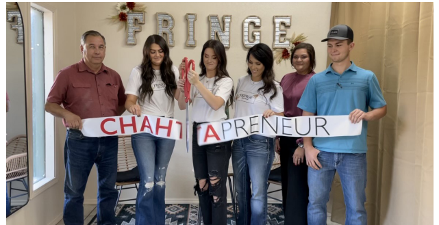
Fringe Salon & Spa POTEAU | DISTRICT 4