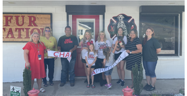
The Fur Station HUGO | DISTRICT 8