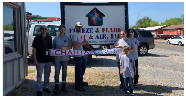
Freeze & Flare Heat & Air, LLC MCALESTER | DISTRICT 11