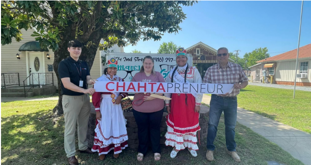
Uniquely Geek, LLC TALIHINA | DISTRICT 3