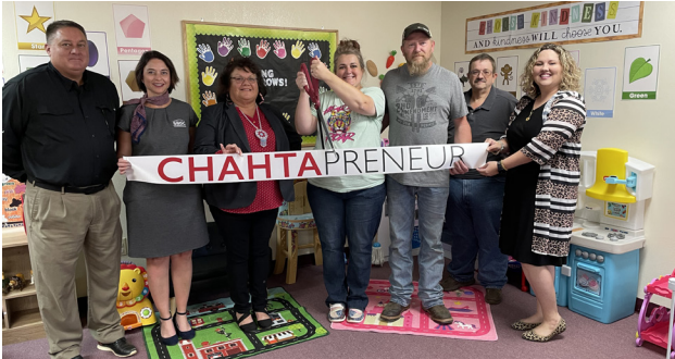
Raising Arrows Learning Center, LLC WILBURTON | DISTRICT 6