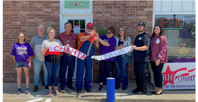
Kim's Flowers CAMERON | DISTRICT 4