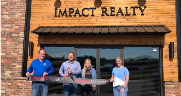
Impact Realty, LLC DURANT | DISTRICT 9